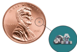
Figure 1 – iStent inject W compared to a penny

These 2 stents are preloaded into a custom injector, which is the instrument your surgeon uses to implant the stents in your eye. During implant surgery, the 2 stents will be placed closely together to help reduce eye pressure.