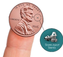
Figure 1 – iStent inject compared to a penny

These 2 stents are preloaded into a custom injector, which is the instrument your surgeon uses to implant the stents in your eye. During implant surgery, the 2 stents will be placed closely together to help reduce eye pressure.